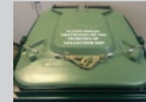
Snaphooks unlocked for collection

Remember to unclip your locks on collection day.