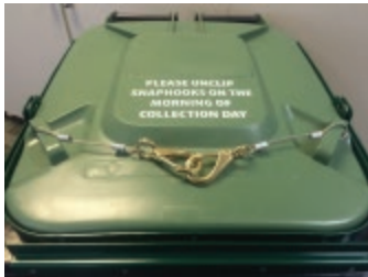
Snaphooks unlocked for collection